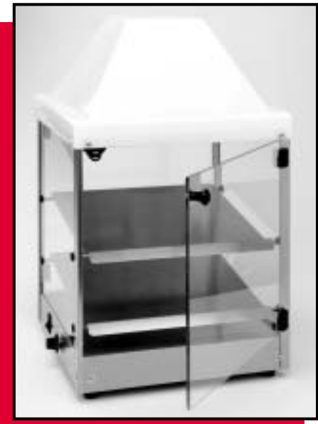
MODEL DWC-13 DISPLAY CABINET